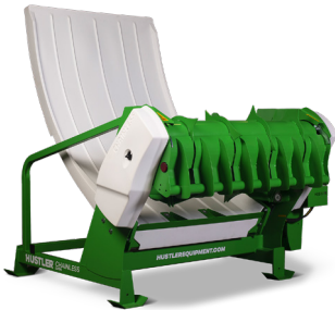
MOUNTED CHAINLESS LX104